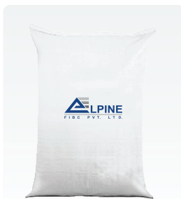
PP Woven Sack