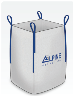
U panel/ Builder