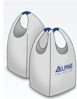
One loop/ Two loop