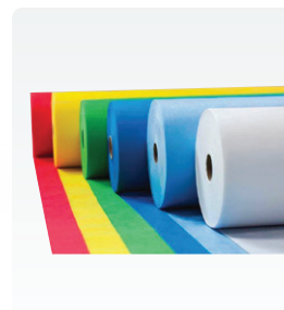
PP Woven Fabrics