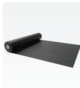
PP Ground Cover